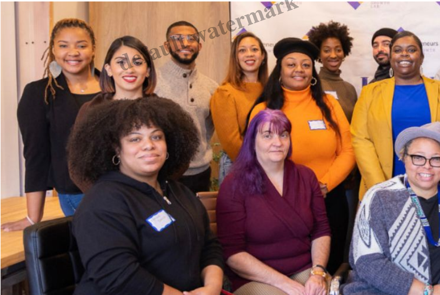
Guild For Growth

Together, we can build a more equitable and inclusive community.